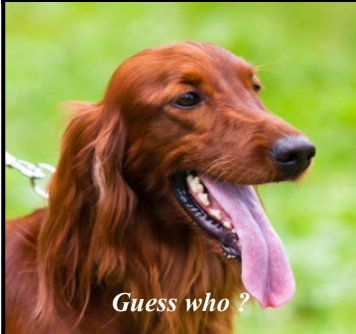
Guess who ?