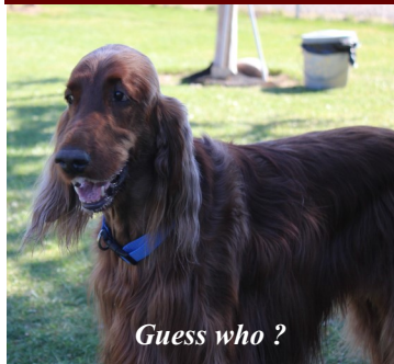
Guess who ?